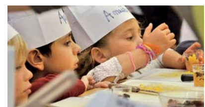
Figure: Change in liking scores among fourth- and fifth-grade children over 10 tastings

Note. Numbers on the horizontal axes correspond to the number of tastings. Group 1: "Dislikers" at the first tasting and Group 2: "Likers" at the first tasting.